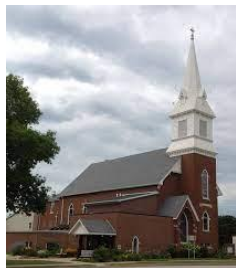
First Lutheran Church