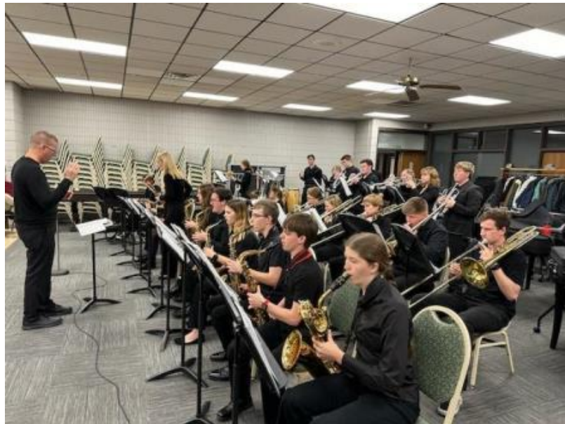
Program by Geneseo High School Jazz Band