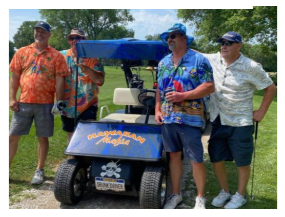
Honorable Mention – Best Theme: Hawaiian Mafia (Not Kiwanians)