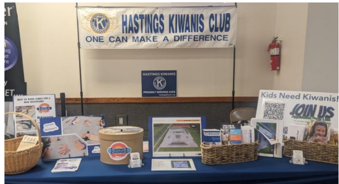
We promoted the new Skatepark, Kiwanis membership, and Hearts & Hands Against Hunger