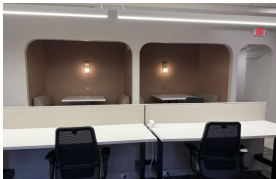
Lower Level flexible space. There are also individual offices on the Lower Level, as well as the podcast studio.