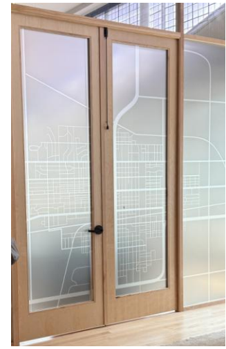
City map etching on the entry door