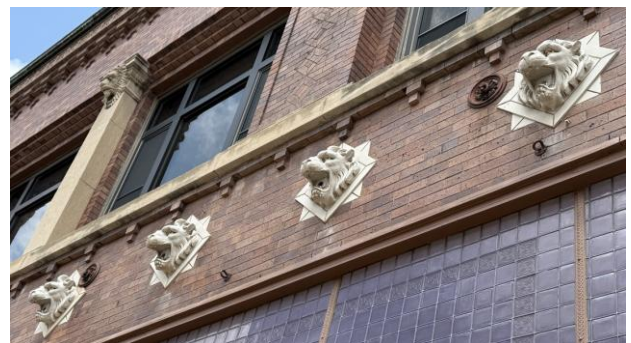
These lion heads originally held up a flat awning. The design has been carried on in windows throughout the building.