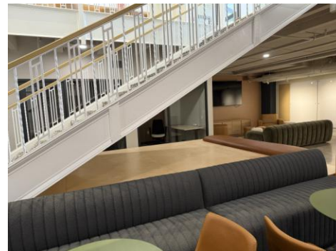
Some Lower Level gathering space