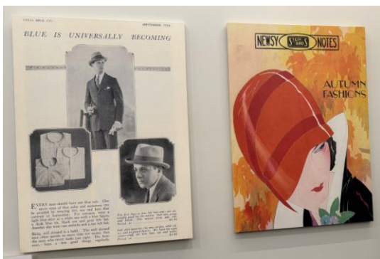
Some poster-size pages from the Stein Brothers merchandise catalog.