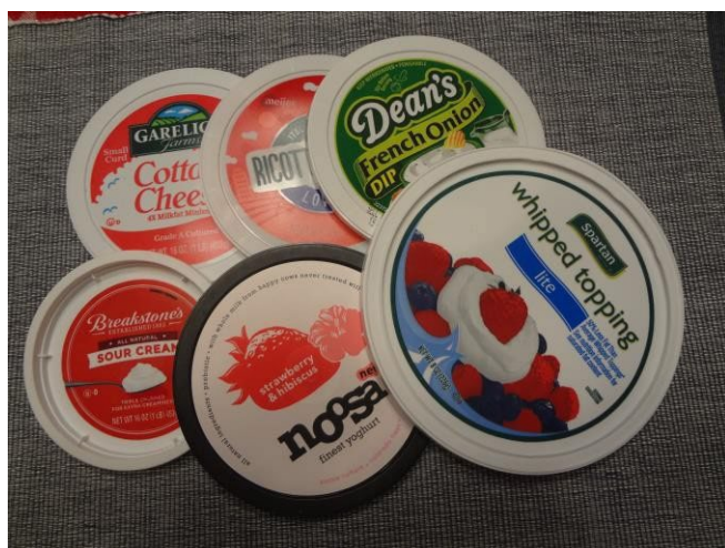
Cottage Cheese, Sour Cream & Cool Whip Container Lids