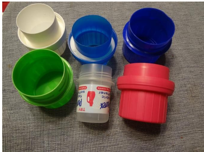
Detergent Caps with white gasket and label removed