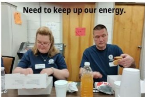
Need to keep up our energy.