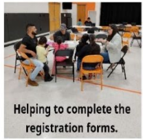
Helping to complete the registration forms.