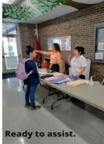
Ready to assist.

Lenoir City Elementary School – April 6, 2023 You can always count on our Kiwanis Members.