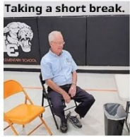
Taking a short break.