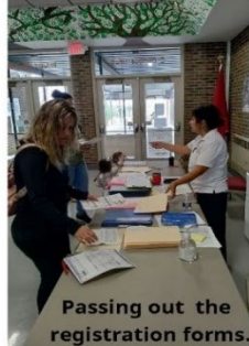
Passing out the registration forms.