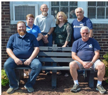
Alnwick Community Center Non-Profit Outreach Community Outreach Center