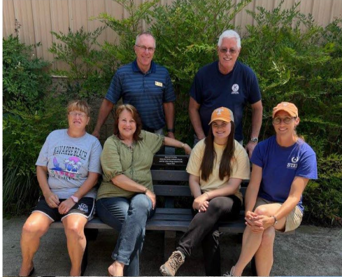
STAR Riding Academy