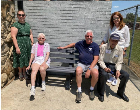
Boys and Girls Club, Oak Ridge.