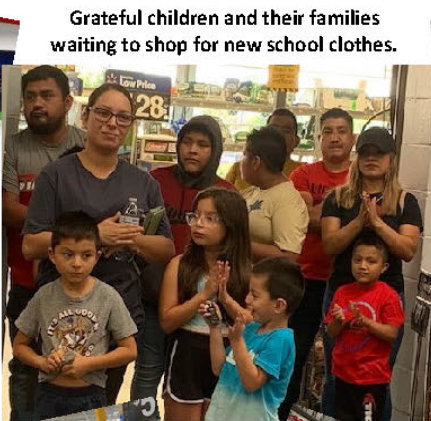
Grateful children and their families waiting to shop for new school clothes.