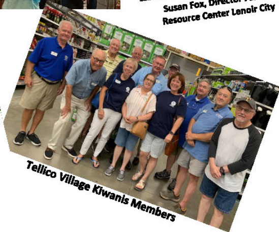
Tellico Village Kiwanis Members