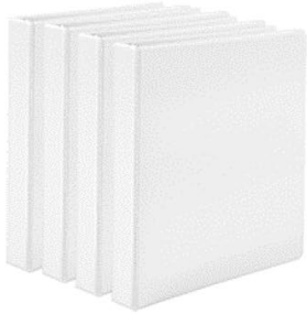
3 ring white binder: 1 inch clear view with clear pockets inside covers.