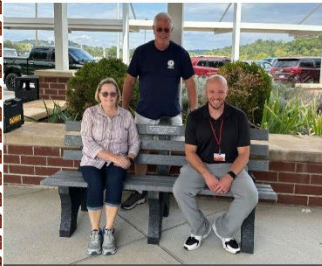
FT LOUDOUN MIDDLE SCHOOL – BENCH #36

200 pounds of non-recyclable plastic lids and bottle caps create a bench. To-date, we have managed to keep 7,600 pounds of plastic out of the landfills.