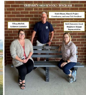
GREENBACK HIGH SCHOOL – BENCH #38