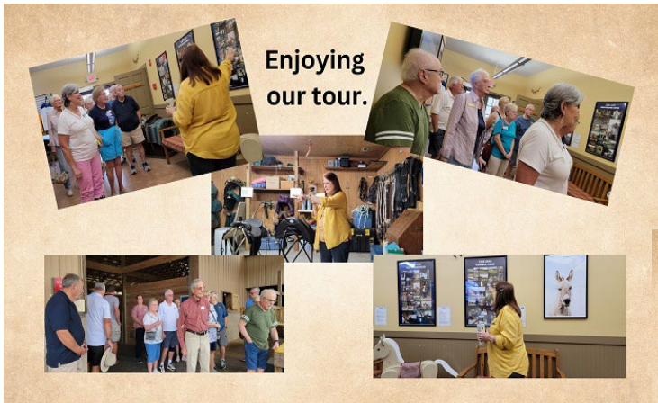
Enjoying our tour.

Our members were in awe of the facility. But, they were more impressed with you. Your fortitude, dedication, and commitment. What a wonderful, social gathering experience for members.