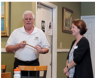
Passing The gavel to our next club President