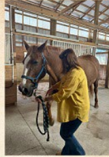
Meeting Sampson! He is a Chestnut Draft Cross sponsored by our club.

Sampson is STAR's laid back, go to, do it all guy.