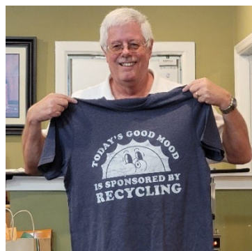
Great Tee Shirt Mr. Past President