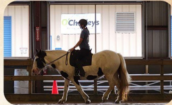
Rider and horse enjoying a workout. They stopped to say hello!