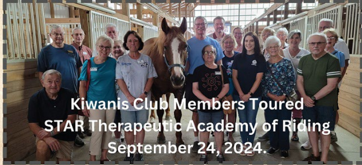
Kiwanis Club Members Toured STAR Therapeutic Academy of Riding September 24, 2024.