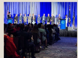
100 years of International Governors