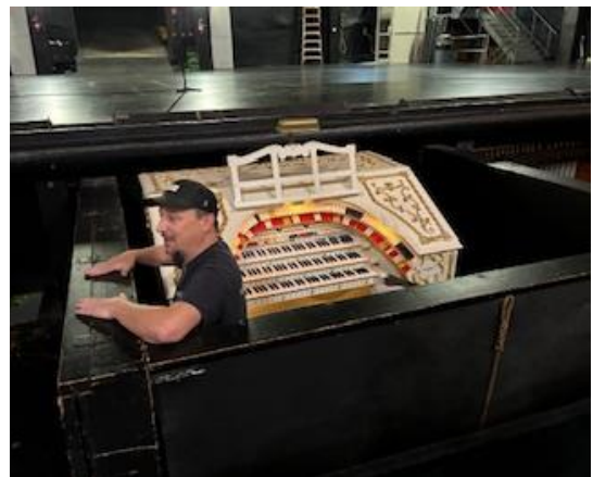
Lowers all the way down below orchestra pit