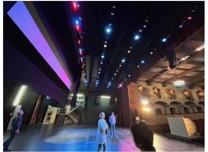
Some of the lighting & pulleys for curtains