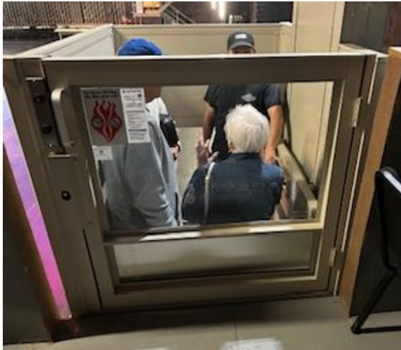
The new lift on stage to avoid stairs