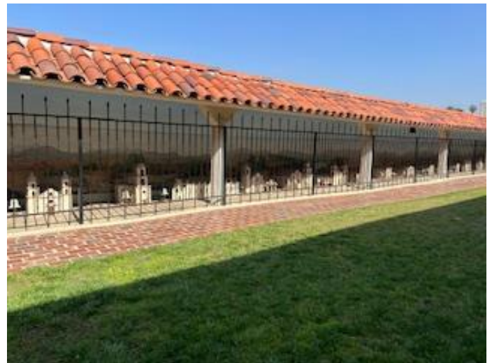
They have miniature replicas of the 21 missions in California