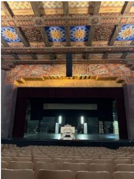
Looking from the back of theater and from the stage. 1380 seats