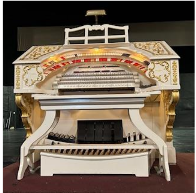
Silent movies accompanied by the theater pipe organ are fun performances there.