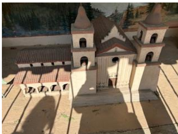
The Santa Barbara Mission