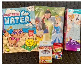
We made 11 of these.