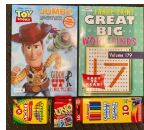
We made 24 of these.