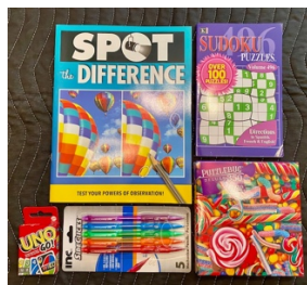
We made 10 of these.