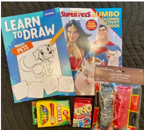
We made 6 of these.

Our service project today was fun! A heartwarming effort knowing that our kits will bring some fun to children that certainly deserve it. We made a total of 50 Activity Kits! The coloring book & puzzle themes vary, but other items are set in each package.