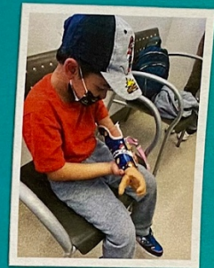
Marveling at his new prosthetic arm