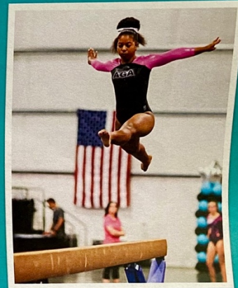
Tarra' at a gymnastics event