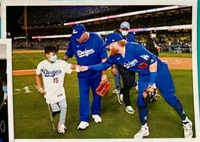
Tossed 1 st pitch at Dodgers game