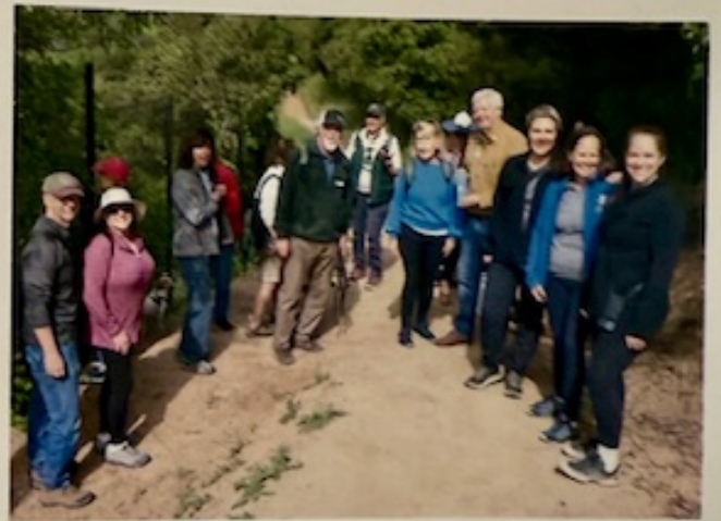
Hikers on their way up the new Sister Cities Friendship Path