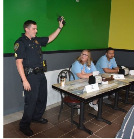
Always interesting activities shared with those special adults at the Aktion Club.