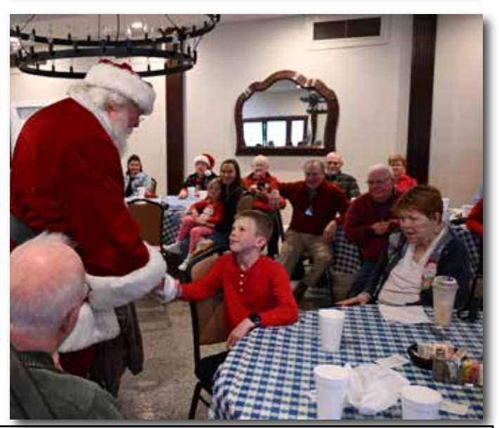
Maryville Kiwanis Kourier