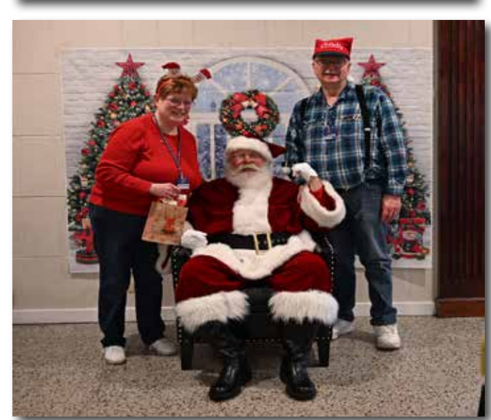
Maryville Kiwanis Kourier