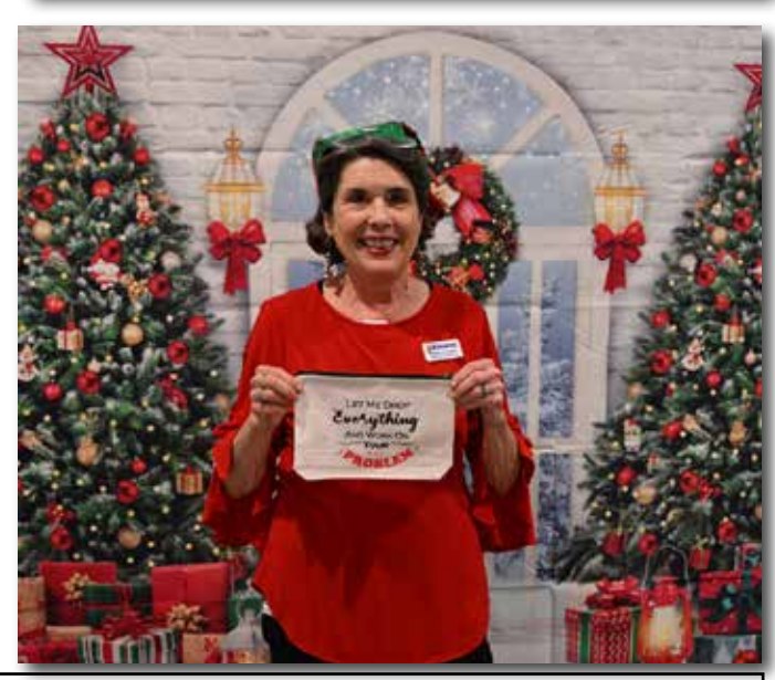
Maryville Kiwanis Kourier