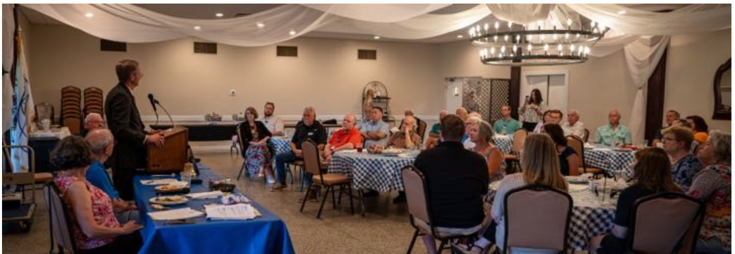
The crowd is all ears listening to the Congressman. He has a special ability to communicate in his own colloquial style. Acting in several House committees he has penned many bills and discussed these at the meeting. He doesn't mind saying what he thinks which has endeared him to much of the area voting public.