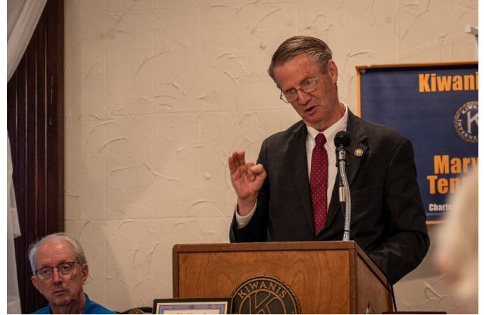
Representative Burchett captures the moment while managing a multifaceted discussion on what is happening in Washington, D.C.