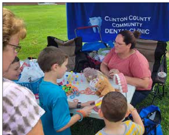
Learning About Tooth Care – Kids learn how to keep their teeth clean.