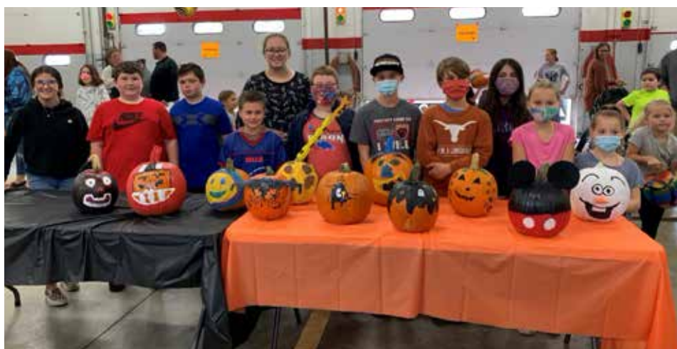
Pictured above are recent club service projects: blanket tying for youth in need and a pumpkin painting contest.