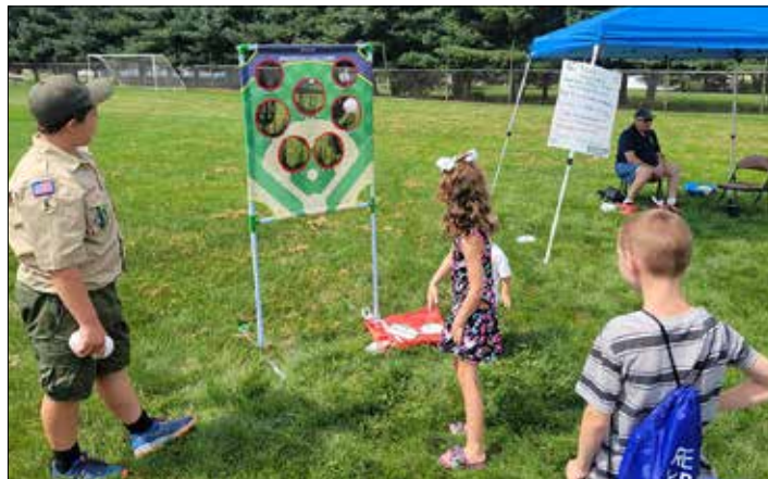
Scout Ball Toss Game – Scout from BSA Troop 711 runs ball toss game.