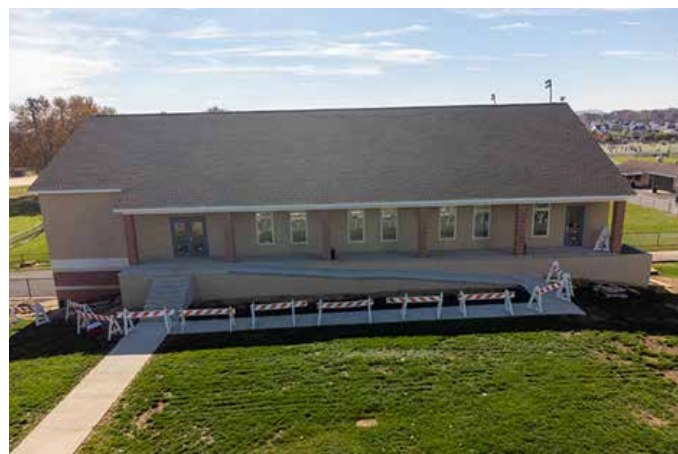
The Kiwanis Club of Palmer's almost completed Youth Center.