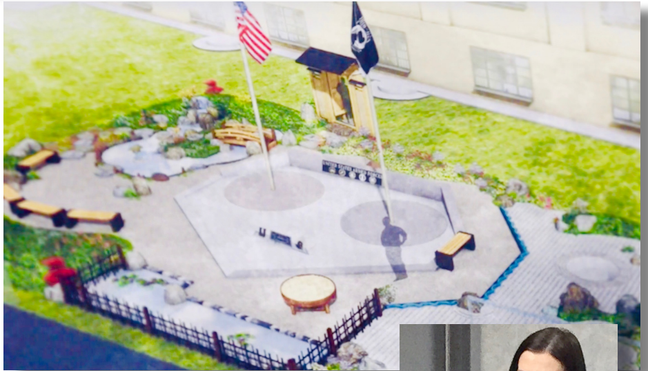
A rendering of the design for a "Healing Garden" at the Oregon State Penitentiary..