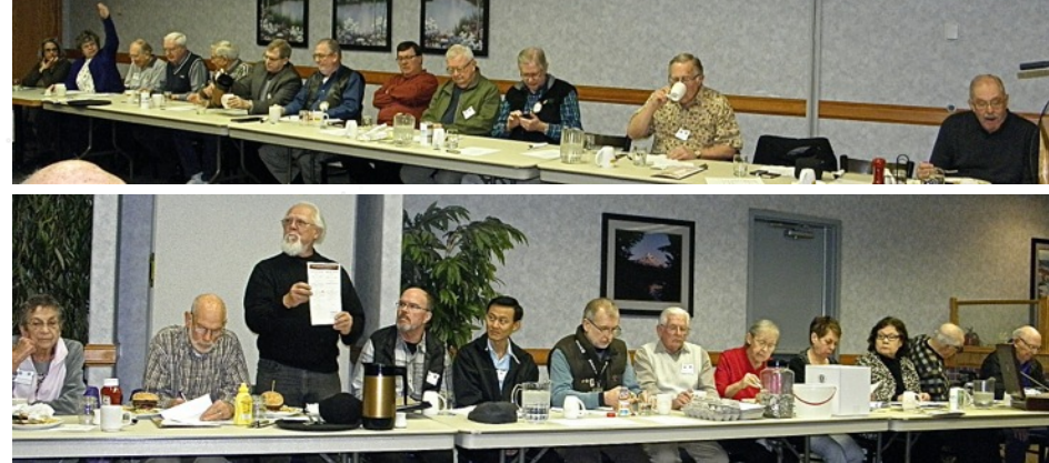
A good turn out for the "Projects Meeting"