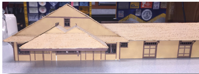
Scale model of the original depot building