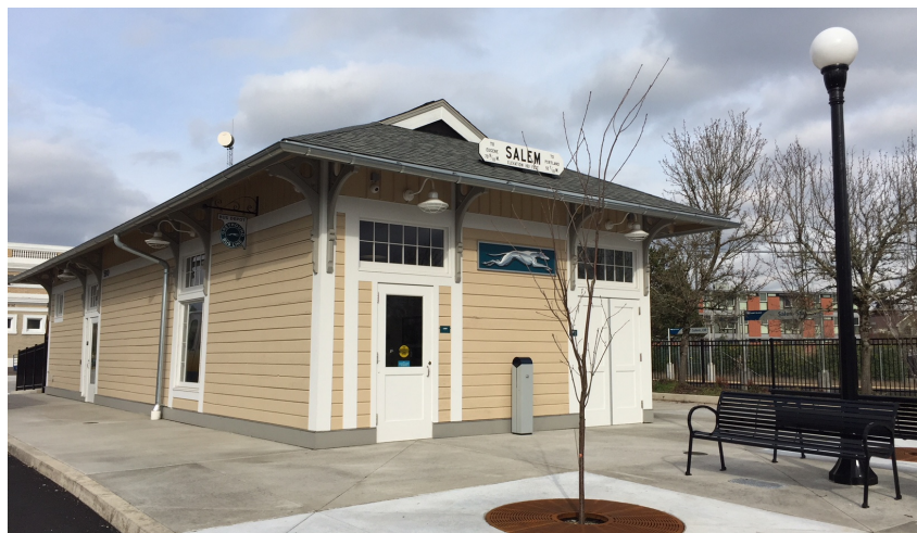
The renovated building today

There is a nice video on the Statesman Journal page that covers some of what we were shown today. http://www.statesmanjournal.com/videos/news/2018/01/29/renovation-rail-station-baggage-depot/109922794/