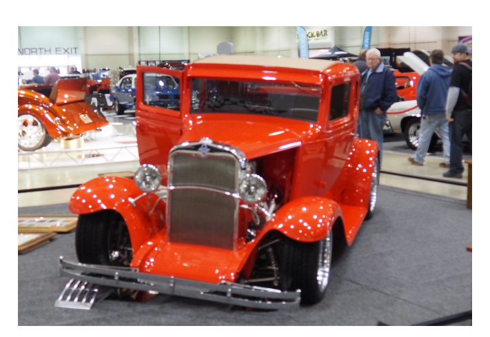
Roaring Red Roadster