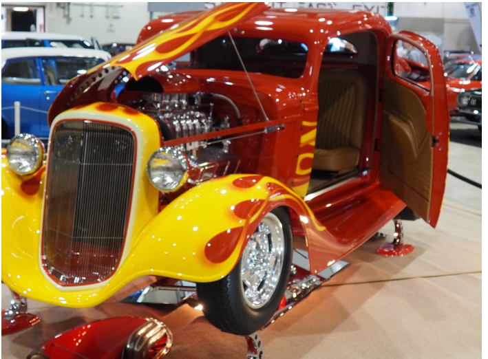
Fantastic Flaming and Fast

It was reported that the Roadster Show sold $1,640 in Mustang Raffle Tickets. Thanks to Salem Kiwanis members who helped at this event.