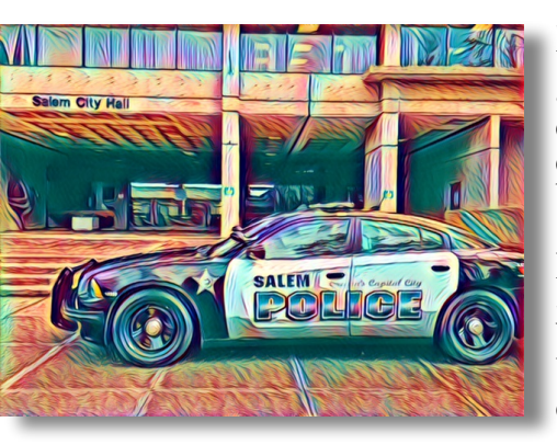
Salem Police headquarters is housed in the Salem Civic Center complex circa 1972