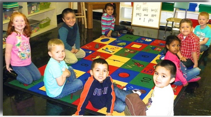
Pre-school class at St. Vincent de Paul