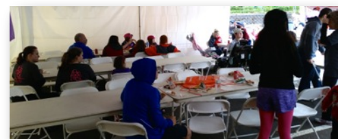
March of Dimes March for Babies event