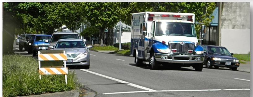
One of two ambulances that came through on Commercial Street