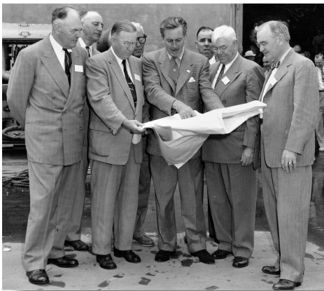
Walt Disney, center, shows Disneyland plans to Orange County officials, December 1954