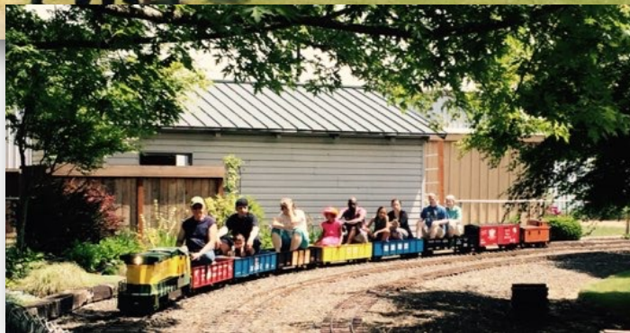
Free train rides for big kids and little kids too.