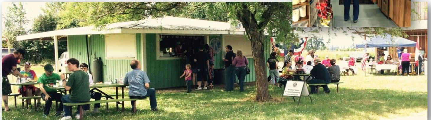
The Salem Kiwanis Food building was the place to enjoy the beautiful day, with hot dogs, chips, cookies and drinks.