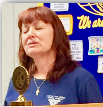
Singing “Oh Danny Boy”.