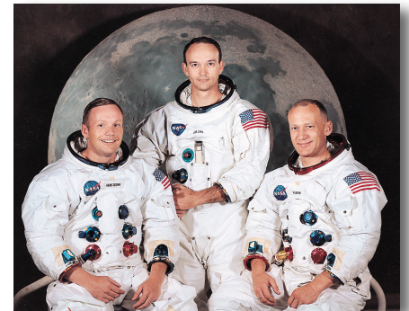
The crew of Apollo 11 (from left to right): Neil Armstrong, Michael Collins, and Edwin ("Buzz") Aldrin.