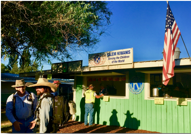
A good day for big hats.