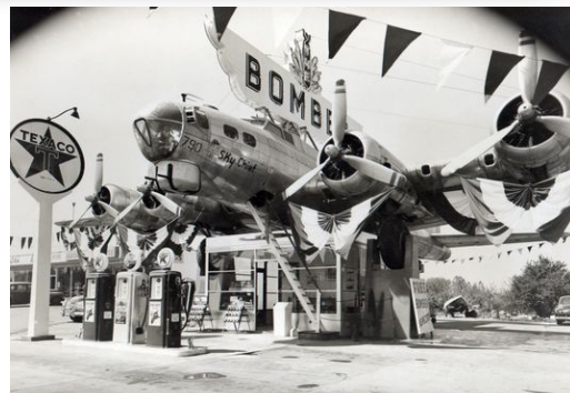
This B-17 Flying Fortress, used as a canopy for a gas station in Milwaukie Oregon for nearly 64 years.