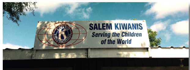
Signs of the times.