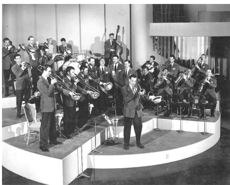
The Glenn Miller band

A group of volunteers are working together to bring the story of this unique history of a nation coming together to preserve freedom for all.