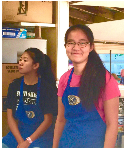
Key Club young ladies were a big help.