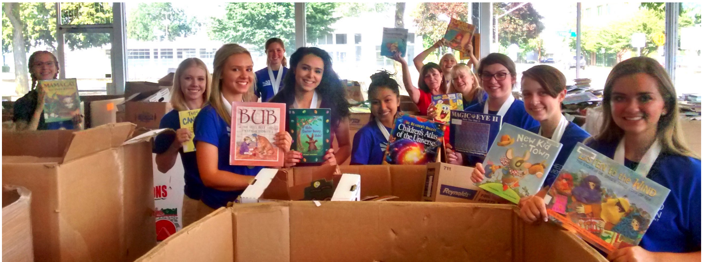
Distinguished Young Women help with book sorting after the meeting today.