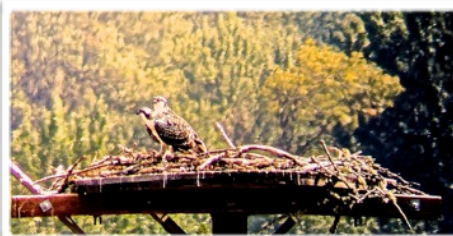
Osprey nest a half block away from Bill's deck seen through a scope.

B arbara Chesbrough provided the program today. It was a dual program on the SIGN