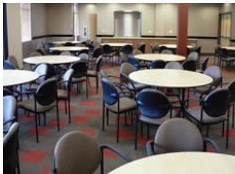
The Green Room seats up to 150 people theatre style or 96 people when 5 ft round tables are added.