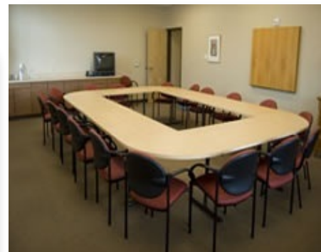
This meeting space seats 20 and has access to the kitchen and is equipped with sink, 48" Apple TV computer monitor, wireless connectivity and white board.