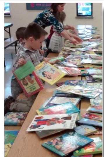
Books for kids at Lee Elementary school on Thursday October 15.