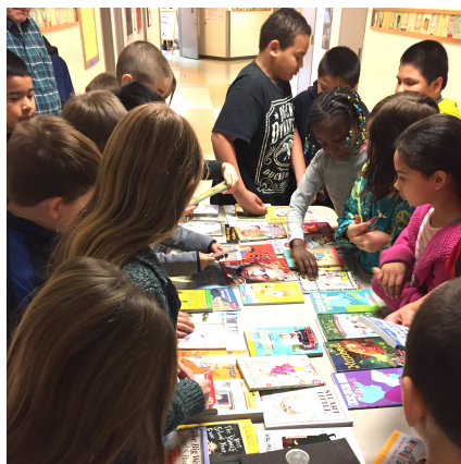
Another successful book delivery at Bush Elementary on Friday Dec. 8.

Oregon is one of the largest producers of hazelnuts in the U.S. In fact, 96% of hazelnuts are produced in Oregon. But U.S. production is only 4% of the