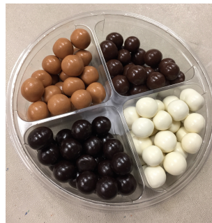
Yummy samples brought to us by our guest speaker.