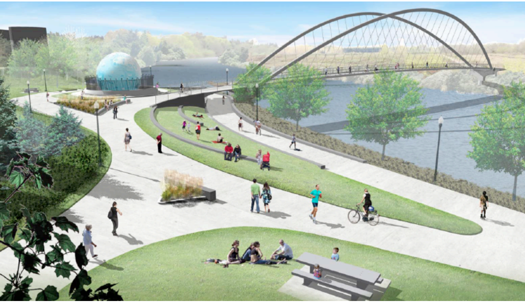
Conceptual illustration of the Minto Island Pedestrian and Bicycle Bridge in Riverfront Park.