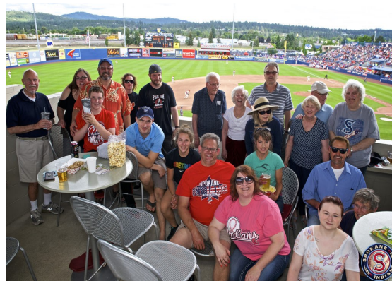
Father's Day at a Spokane Indian's Baseball Game