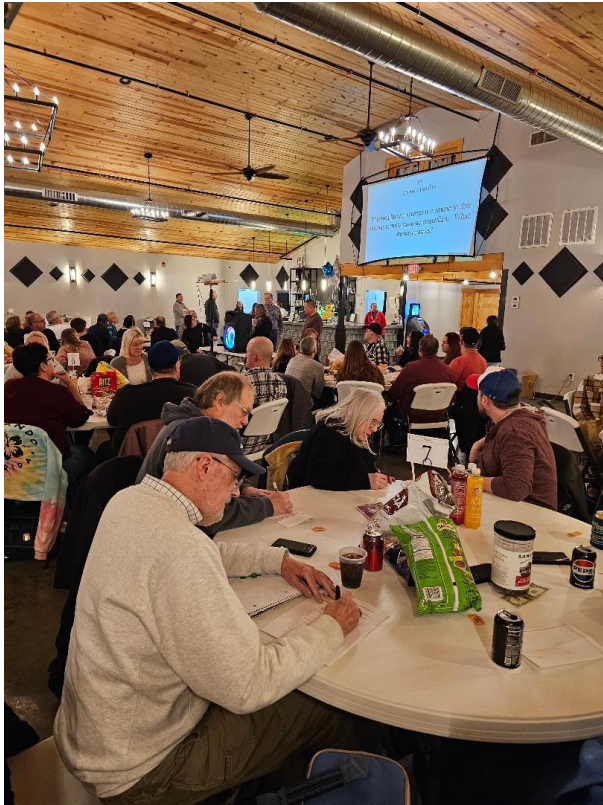
February 23, 2024 Kiwanis Trivia Night at the Hickory Creek Event Center