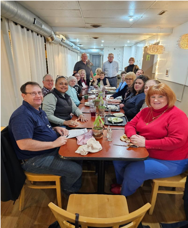
Davenport Kiwanis enjoying lunch at NEST Café for an off-site meeting on January 25, 2024. The food was delicious!