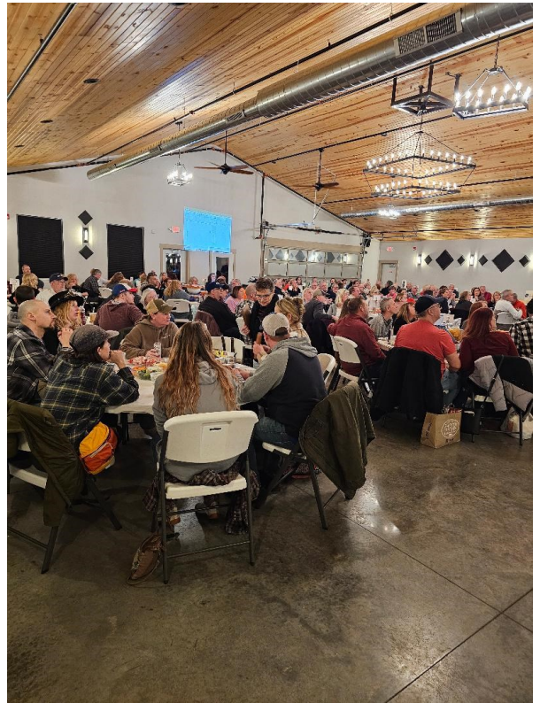
February 23, 2024 Kiwanis Trivia Night at the Hickory Creek Event Center