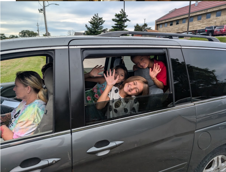
Friendly House Back to Swell event!