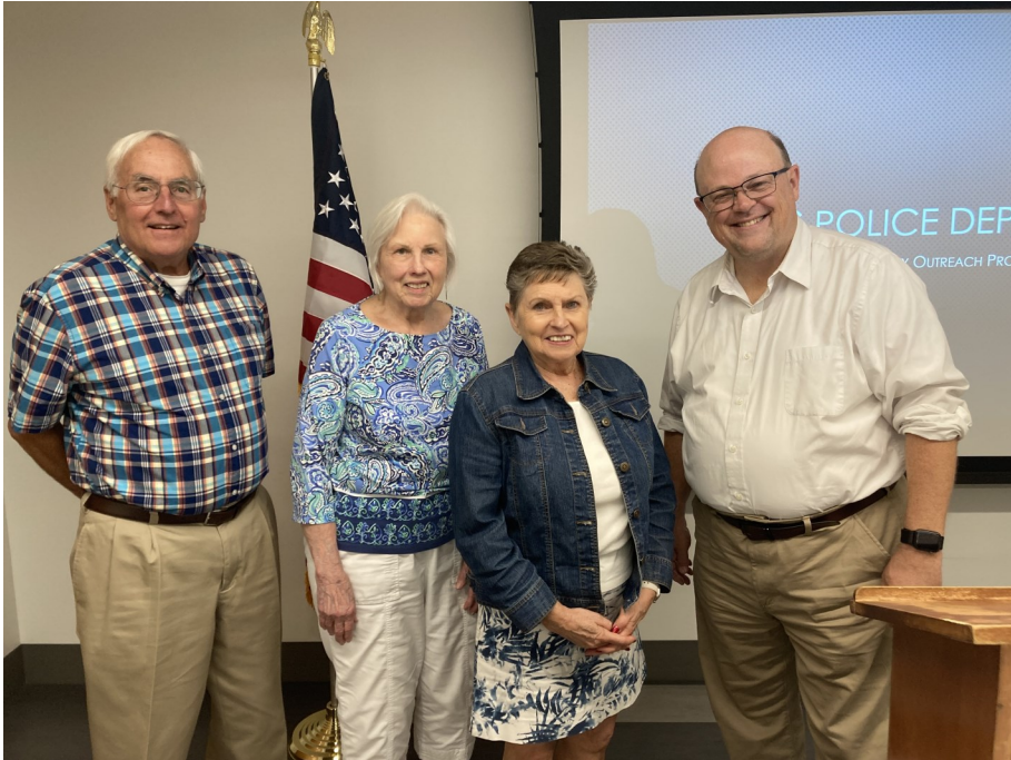
Inter-Club visit to East Moline, L to R: