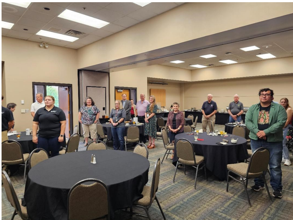
Great attendance at the September 5, 2024 noon Davenport Kiwanis meeting!