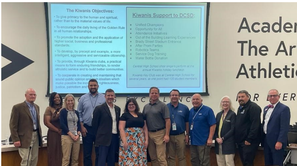
Davenport Schools recognizing Davenport Kiwanis for their support of programs.