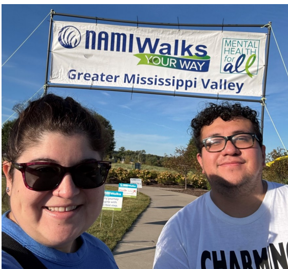
9/28/2024: (left) Kiwanis at NAMI Walks and (right) Café on Vine, serving up good food!