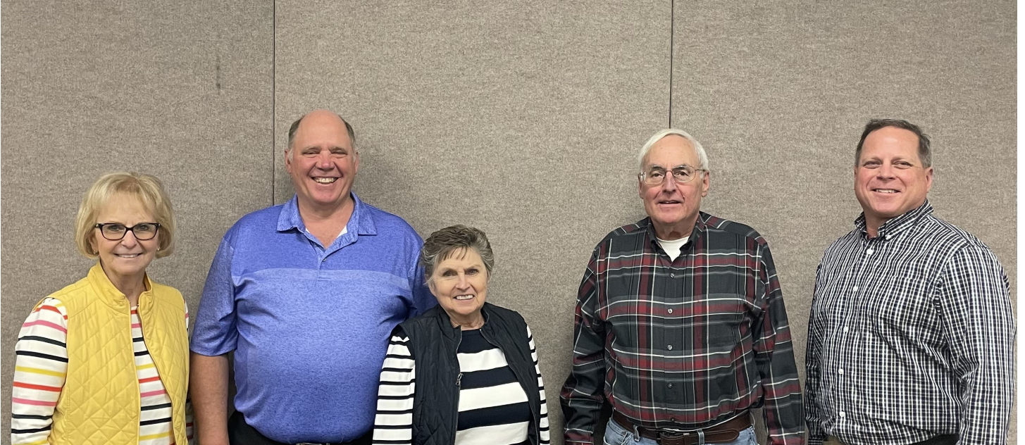
January 28, 2025 Davenport Kiwanis who went over to Bettendorf for an Inter-Club visit.