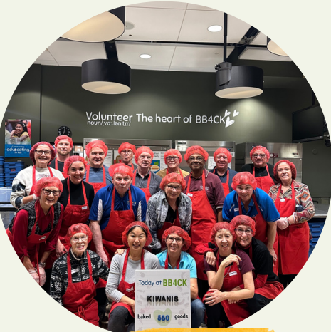
Busy making cookies and muffins at BB4CK