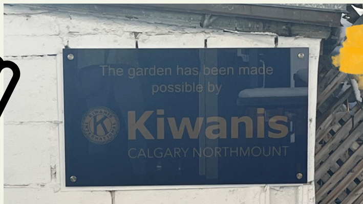
Our plaque on display at the Women's Centre garden!