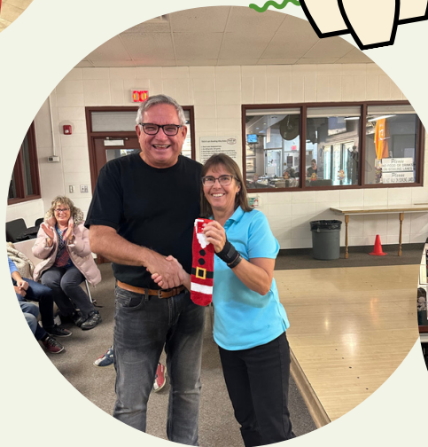
Fun night of bowling! There were low scores, high scores, and lots of laughs!