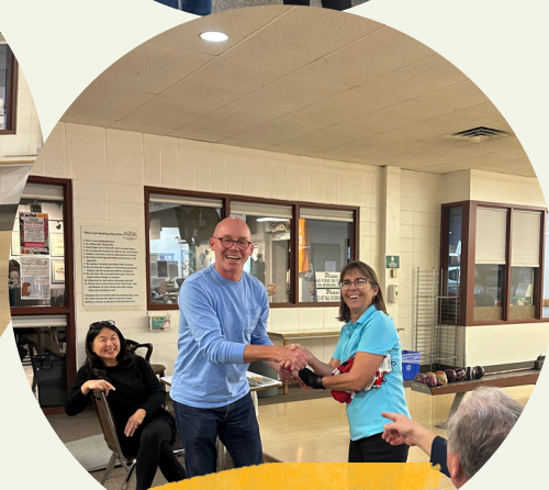
The big winner with 176!!