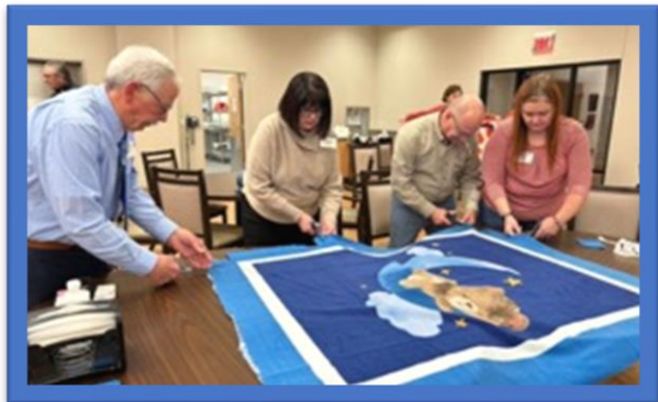
Members of BGSU Circle K International also attended. The meeting concluded with participants making fleece tie blankets.