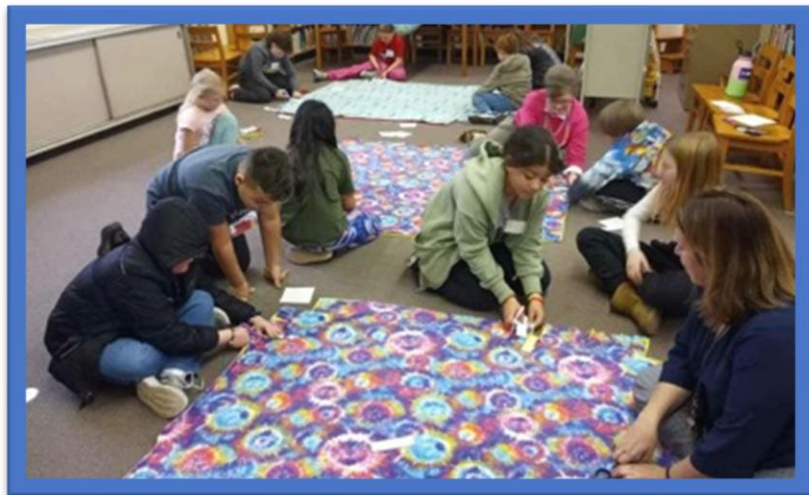
After having to miss their January meeting, the K-Kids had to pull double duty. They had fun decorating Meals on Wheels bags for Valentine's Day and worked hard cutting fabric to make no-sew blankets.