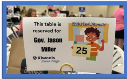
(Left) Ohio District Kiwanis Foundation golf outing, Uniontown, July 18. (Right) Kiwanis Club of Findlay's 6 th Annual Purse Bingo, July 18.