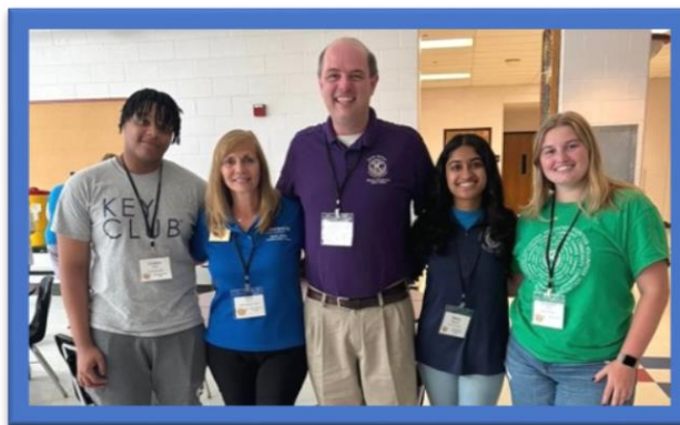
Ohio Aktion Clubs' Leadership and Education Day, July 20, 2024, Delaware, OH