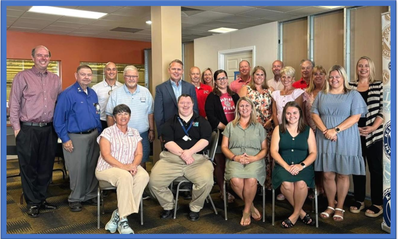
Service club teachers and club sponsors pose for a group photo.