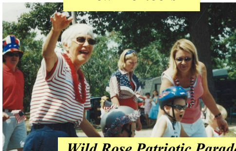
Wild Rose Patriotic Parade