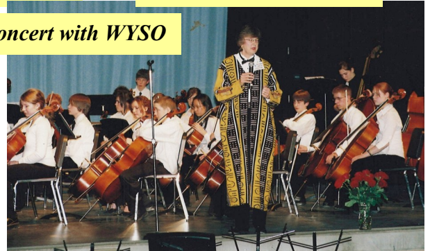
Spring Concert with WYSO