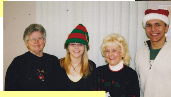
Students of the Month