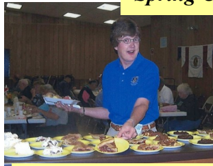
Polish Polka Time