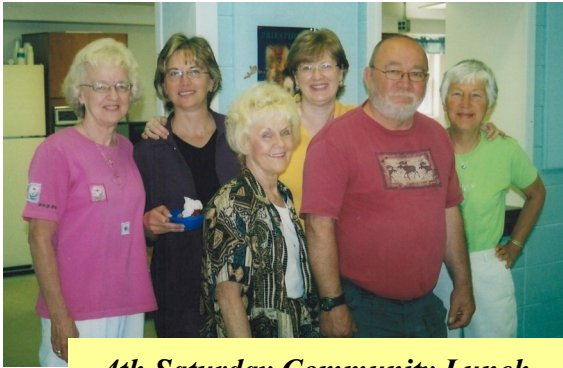
4th Saturday Community Lunch