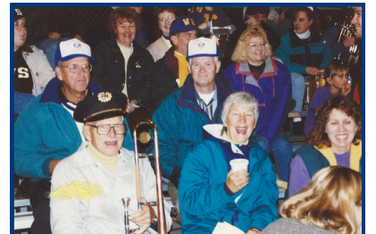
Homecoming Football Game