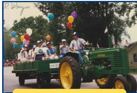
Wild Rose Days Parade