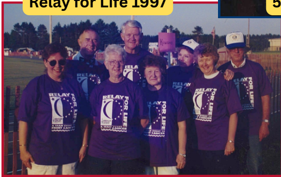
Relay for Life 1997