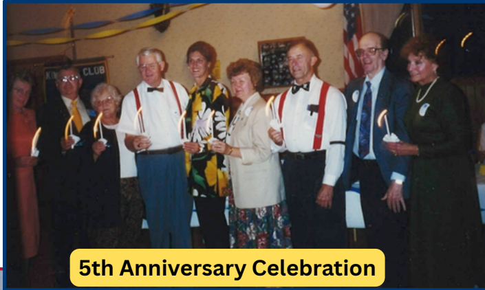
5th Anniversary Celebration