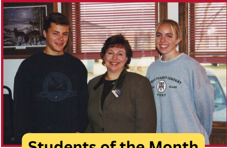
Students of the Month