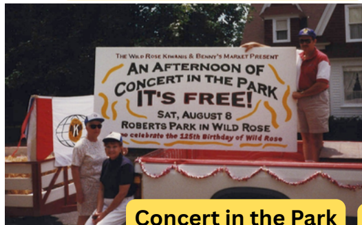
Concert in the Park