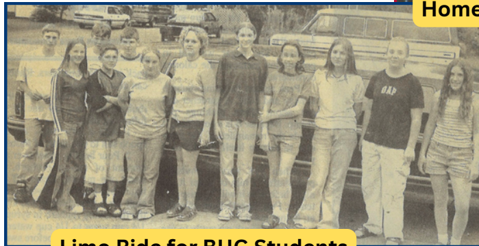
Limo Ride for BUG Students