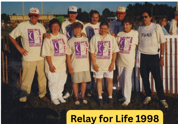
Relay for Life 1998