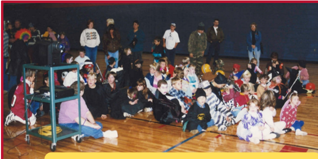
Our First Halloween Costume Party