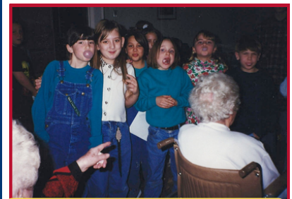
Movie Night at the Manor