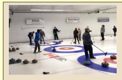
Curlers getting their rocks off at the Annual Kiwanis Bonspiel!